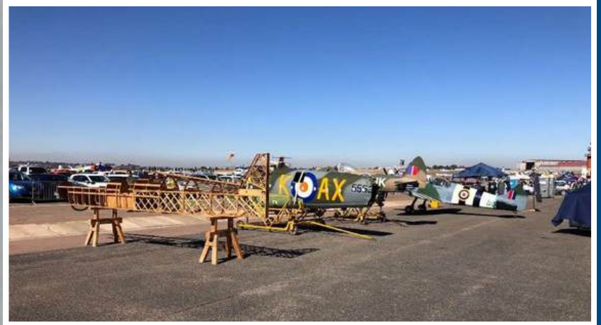
South Africa’s four Spitfires.